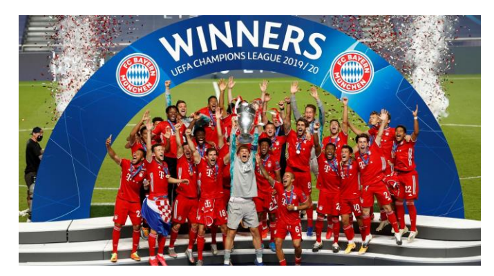
Most successful Soccer Team