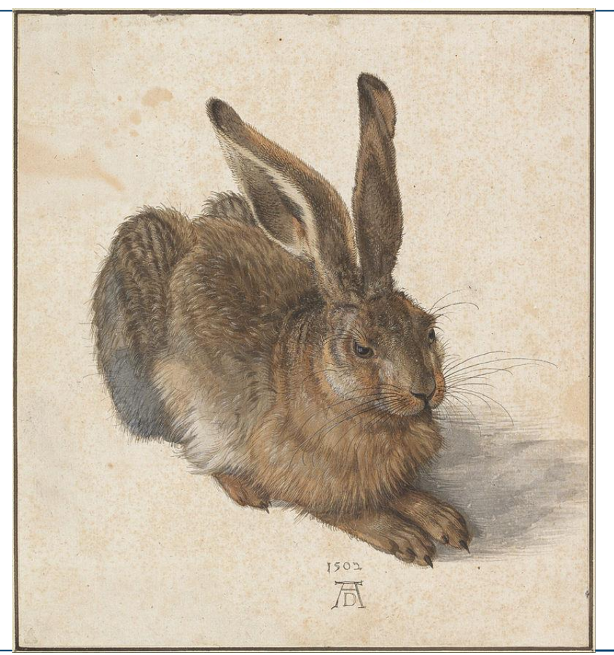
STAMP-Online Innsbruck 2023